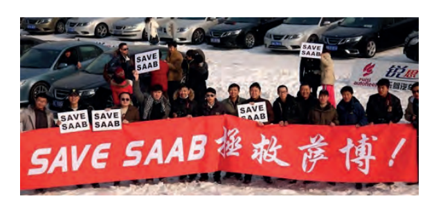
Figure 2: 'SAVE SAAB' gathering

Another example of trying to have their voice heard globally through English is the group members' recent efforts in 'Save Saab' from bankruptcy. When Saab filed for bankruptcy, the Chinese Saab owners displayed tremendous brand loyalty and publicly pledged to save Saab (Figure 2).