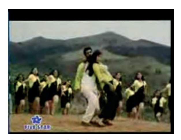
The leading couple with their entourage

The original video depicts a song and dance scene with a large group of young women and men on a green mountain slope. The song and dance number represents the flirtation and wooing going on between the two main characters. The lyrics of the Tamil song Kalluri Vaanil in the original film, their English translation, and the buffalaxed subtitles can be accessed at <a href="http://www.youtube.com/watch?v=wyp7D2Nzib0">http://www.youtube.com/watch?v=wyp7D2Nzib0</a>.