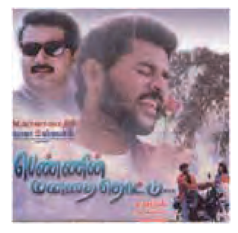
An advertisment for Pennin Manadhai Thottu

Benny Lava (http://www.youtube.com/watch?v = uYwS9k1ZexY) is a resemiotization of a song and dance number from a South Indian Tamil motion picture Pennin Manadhai Thottu (2000). The film depicts a romance between a famous heart surgeon Sunil (Prabhu Deva) and Sunitha (Jeya Seel) who seeks his help for a child with a heart problem. Eventually it turns out that the two had been in love in college but that the man had deserted her at a crucial time. This misunderstanding is finally overcome and the two protagonists are united again.