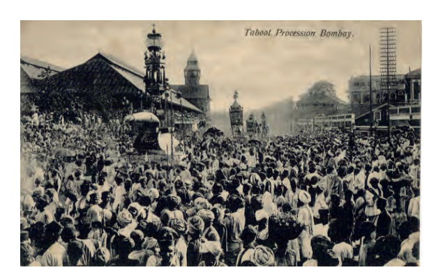
Figure 7: Taboot Procession, Bombay, late nineteenth or early twentieth century.

the ta'zyeh was no longer associated with the processions. Moreover, when the main Mumbai procession in Dongri was established during the late 1960s and early 1970s, it was towards the Rahmatabad cemetery in Mazgan and not a seafront (figure 6). Therefore, unlike other Indian cities, the ta'zyehs are not carried throughout the main processions in Mumbai. This description is about the ritual in Dongri, known as the heart of Mumbai's Muharram rituals. However, in some areas like Mumbra or Govandi, the ta'zyehs are built and carried in local processions, identifying the Hidustani Shi'a communities that are mainly from UP. It is difficult to define the Hindustani Shi'as in Mumbai, however, Hindustani Shi'as are those who are not Khojas, Bohras, or Iranians. This group is mainly from UP and is not as financially well-established as the other three communities. However, it is also rather difficult to simply limit the idea of Hindustani Shi'as to being lower-class Shi'as.