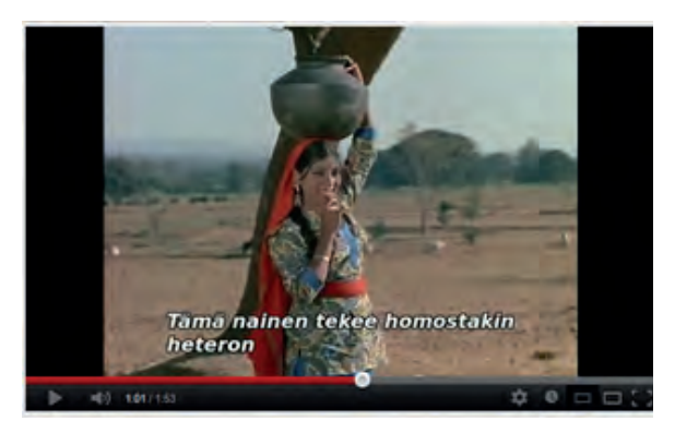
'This woman will turn even a queer into a straight guy'

Another scene of the buffalaxed video which also subverts the heterosexuality of the two men apparent in the original film features a brief encounter with a young woman. The original scene has no dialogue or lyrics, but the buffalaxed video has added subtitles which assign new meanings to the encounter (e.g. 'the sexual orientation of the two Teros is put to the test / This woman will turn even a queer into a straight guy'). Like the practice we know from silent films, the subtitles thus function as narrative commentary steering the interpretation of what we are seeing in the scene in a particular direction.