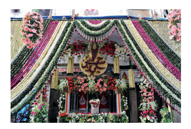
Figure 1: A Bohras' sabil, Dongri, Mumbai, December 2009.

The first thing that anyone would notice on a short walk around Dongri during Muharram is the transition from the Ithna-Asharis' territory into the Bohras'. The Ithna-Asharis' sabils are mainly covered with black textiles, as black is simply the colour of grief. However, the Bohras' sabils are very colourful and completely covered with flowers. This display signals the Hindu background of the Bohras and can also be perceived as a symbolic way of glorifying the status of the Karbala martyrs.