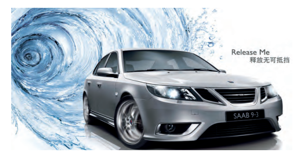
Figure 3: Saab car ad: Release me

Therefore 'mensao' is a particular kind of 'coolness' they constructed, and that they modeled on the coolness they saw in Saab cars. Interviewee A describes their kind of 'coolness' in turn 8 and says that 'Saab is like that', and he repeats this point in turn 10 'there is another side (of Saab), but (both Saab and us) don't like showing off'. 'Mensao' therefore is not only the shared characteristic of the group members but also that of the Saab car. Interestingly, a Saab commercial constructed a similar image (Figure 3).