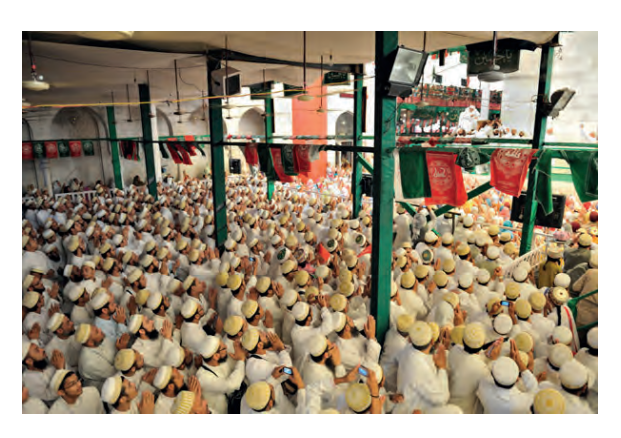
Figure 2: It was an emotional time for Bohras at Rowdt al-Tahera when their spiritual head, Sayyedna Mohammed Burhanuddin, passed by after the majlis , Mumbai December 2010.