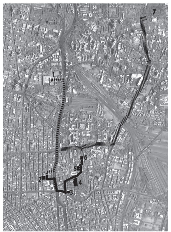
Figure 6: The route of major Shi'i processions in the south of Mumbai; the route of the Iranian procession is shown by the solid-line. (1) Mehfil-e Abol-Fazle Abbass, (2) Namazi Imambara, (3) Shushtari Imambara, (4) Iranian Masjid, (5) Amin Imambara, (6) Anjuman-I Fotowat, (7) Rahmat-abad Cemetery.