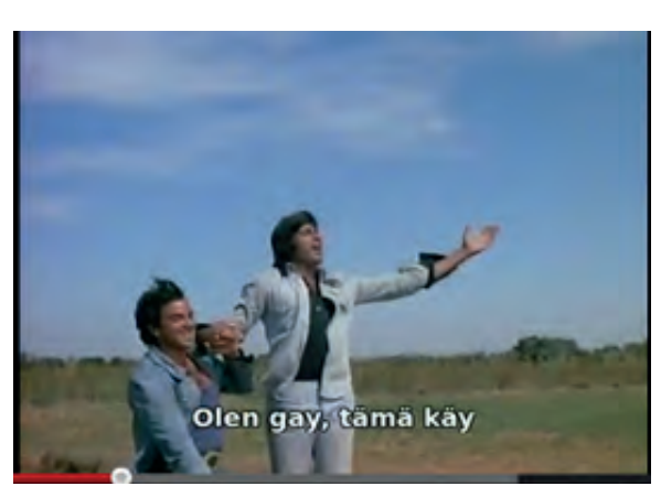
'I'm gay, this is OK'

More specifically, the lyrics drive home this interpretation by their sexually explicit lexical choices. For example, the two men are depicted as having 'fucked' and being 'gay'. In addition, the refrain, "Tero saatana, s'olet gay" ('Damn, Tero, you're gay'), amplified by jocular and emphatic swearing, energetic singing and expansive body language, reinforces the impression that these two men are indeed celebrating their homosexuality here.