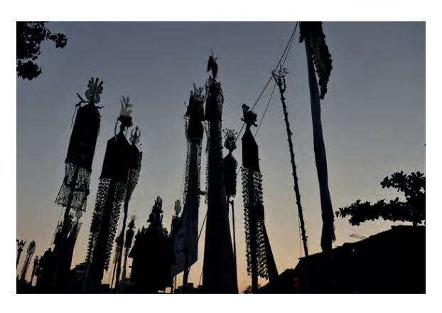
Figure 9: The procession of Ashura afternoon in the south of Mumbai, December 2009

Shi'a Ithna-Asharis, in groups known as anjumans , participate in the procession of Ashura day from all over the city, including Shi'as from UP who come from Mumbra or Govandi. While these anjumans carry their ta'zyehs through local processions, they participate in the main procession in Dongri without the ta'zyehs . In other words, in local processions they signal their UP identity, but when it is time for the main procession they simply follow the Mumbai format of the procession. Indeed, while the Shi'as from UP keep practising their own custom and identity at the local level, they exercise and exhibit their solidarity with other Shi'a communities during the major event.